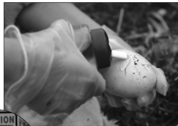
Egg oiling contributed to Brighton's success.