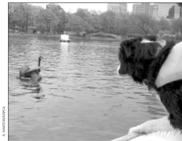
Maisie the Border collie at work in Boston, waiting for her handler's signal.

T HE MASSACHUSETTS SOCIETY FOR the Prevention of Cruelty to Animals (MSPCA) Living with Wildlife program brought GeesePeace to the heavily used green spaces of the Charles River Esplanade and Boston Common and Public Garden this year. Massachusetts